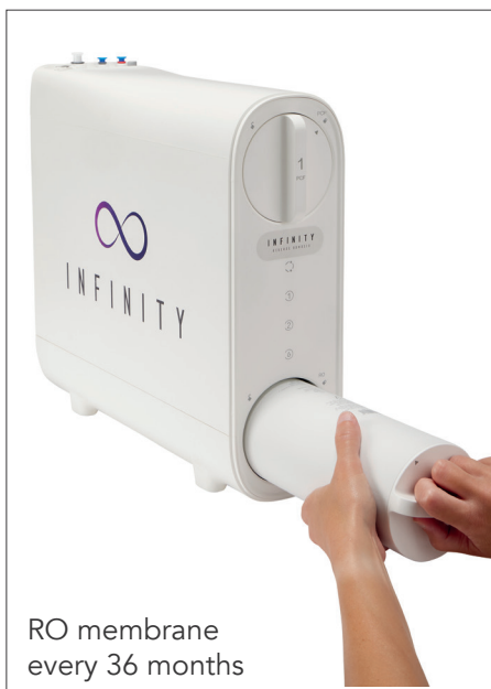
RO membrane every 36 months