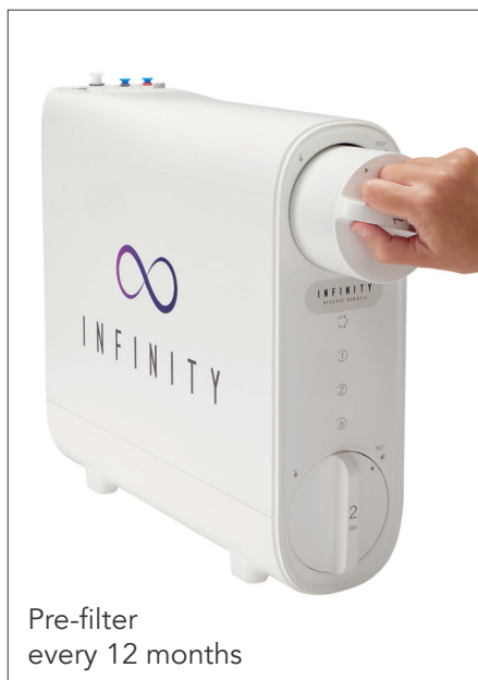
Pre-filter every 12 months